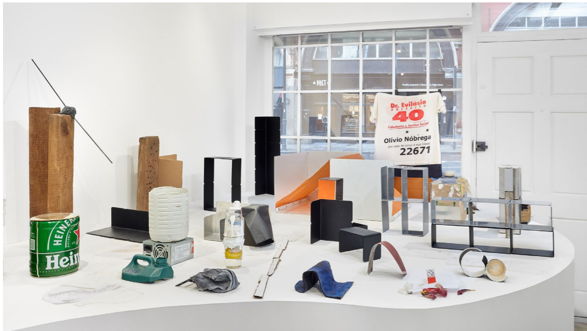
Adriano Costa, 'ax-d. us. t', 2024, installation view.

In a new show at Emalin, London, the artist invites viewers to reassess their own preconceptions about what constitutes art