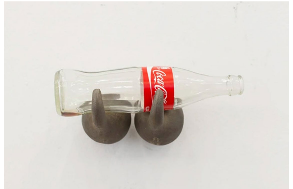
POPTITSTOTHEHITZZZ, 2016, ADRIANO COSTA