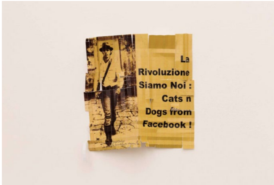
Adriano Costa, Baile De Favela, 2018. Madera. 100 × 103 × 30 cm.