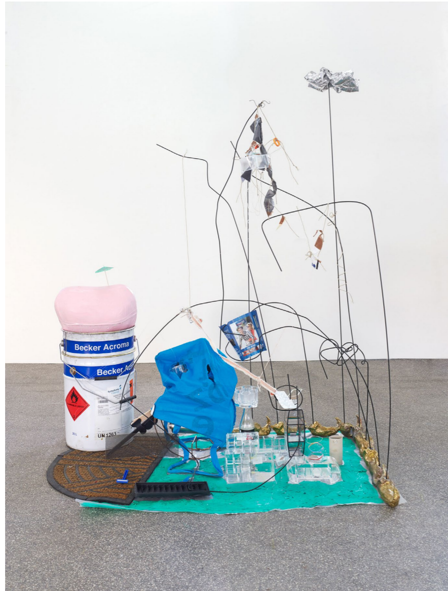
wetANDsomeOLDstuffVANDALIZEDbyTHEartist, 2018 (installation view).

RS What 'big shows' are you referring to?