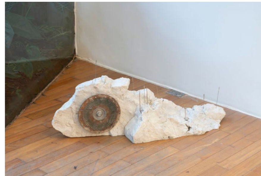
Vista de instalación, Adriano Costa, We Chose Life . What Now, Georg? Tshirts ? en Mendes Wood DM, São Paulo.

Costa's visual grammar seeks to embrace the schizophrenia of the plurality of contemporary patterns. Armed with the typical irony of the Internet age, the artist easily migrates from national ills to foreign news, from the question of refugees to the faint-hearted imagery of consumption in late capitalism. The idea of synthesis posed here goes beyond national boundaries and offers a reflection on the status of the image in contemporary times, in the era of fake news