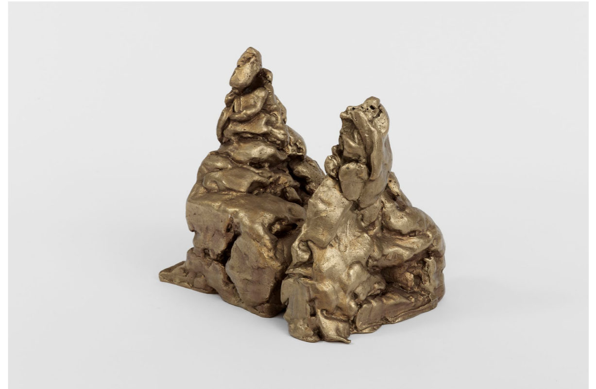
Adriano Costa, Uma montanha fodendo sua própria metade (A mountain fucking its own counterpart), 2024, bronze, 27 × 28 × 24 cm. Courtesy: the artist and Emalin, London; photograph: Stephen James

This review is part of a new series of Must-See shows, in which a writer delivers a snapshot into a current exhibition. Adriano Costa's exhibition 'ax-d. us. t' is littered with perishable goods. The front room at Emalin is taken up by Casas (2023–24), a series of assemblages made from various detritus – a beer keg, a tulip and a square of sandpaper, among other things – brought together to form clusters of vaguely architectural forms. Together, they give the impression of a fragile cityscape. One might be tempted to describe these materials as found objects, but Costa wouldn't; he has said that the idea erroneously implies an essential difference between everyday ephemera and the special items we choose to designate as art. The works on show here are displayed according to this principle of non-hierarchy. Bronze sculptures like Uma montanha fodendo sua própria metade (A mountain fucking its own counterpart) (2024) sit plainly on the floor: after all, why elevate the historically esteemed medium of sculpture? Sampa (2024), a torn-apart and bolted-back-together coffee cup that sits on a window-level surface with the Casas, is equally worthy of reverence. In the grand scheme of time, all objects will turn to dust eventually.