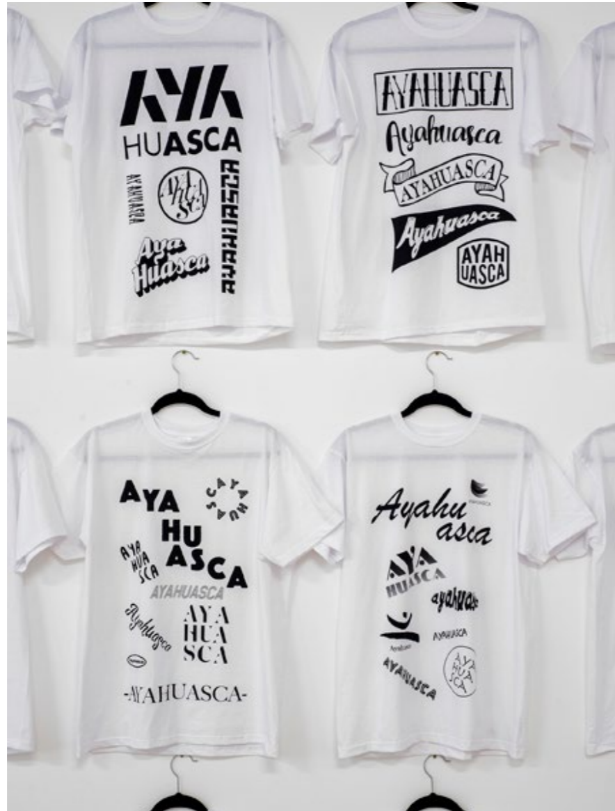
Novos Contemporâneos / New Contemporaries – tea time, 2015, print on fabric, dimensions variable.

an artist. We don't need to be a good person. We can be boring. But it is a show. Never forget we do shows. Ha ha! I just love it.